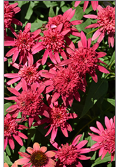
Double Scoop Raspberry Coneflower flowers