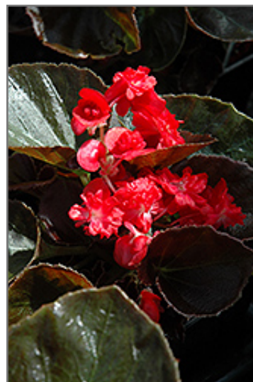
Doublet Red Begonia flowers