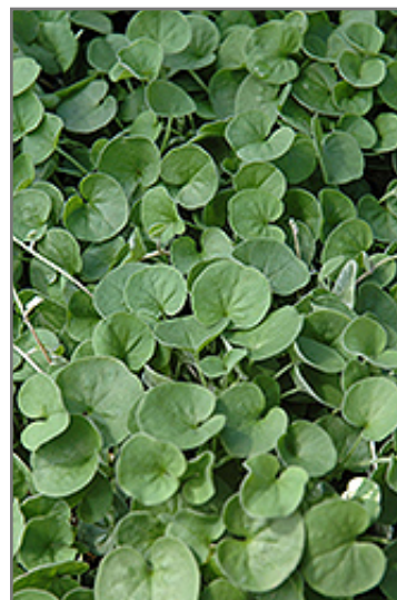
Emerald Falls Dichondra foliage