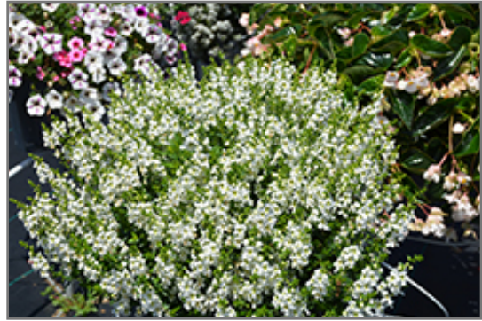
Serenita White Angelonia flowers