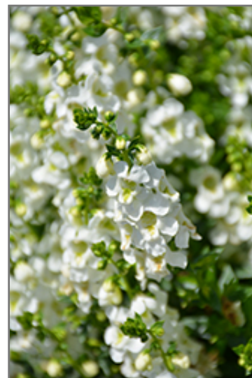
Serenita White Angelonia flowers

Serenita White Angelonia is an herbaceous annual with an upright spreading habit of growth. Its relatively fine texture sets it apart from other garden plants with less refined foliage.