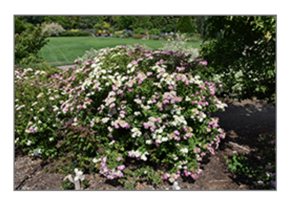
Shirobana Spirea in bloom

Shirobana Spirea is recommended for the following landscape applications;