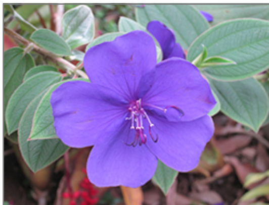
Princess Flower flowers

Princess Flower is recommended for the following landscape applications;