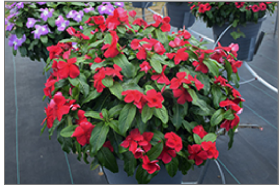
Titan Dark Red Vinca in bloom

Titan Dark Red Vinca will grow to be about 14 inches tall at maturity, with a spread of 12 inches. Its foliage tends to remain dense right to the ground, not requiring facer plants in front. Although it's not a true annual, this fast-growing plant can be expected to behave as an annual in our climate if left outdoors over the winter, usually needing replacement the following year. As such, gardeners should take into consideration that it will perform differently than it would in its native habitat.