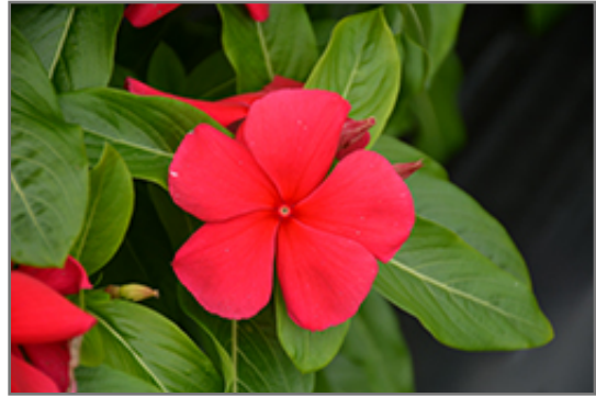
Titan Dark Red Vinca flowers

Titan Dark Red Vinca is recommended for the following landscape applications;