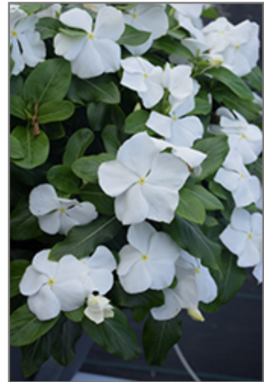
Titan Pure White Vinca flowers

Titan Pure White Vinca is recommended for the following landscape applications;