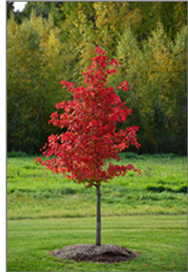
Wildfire Black Gum in fall