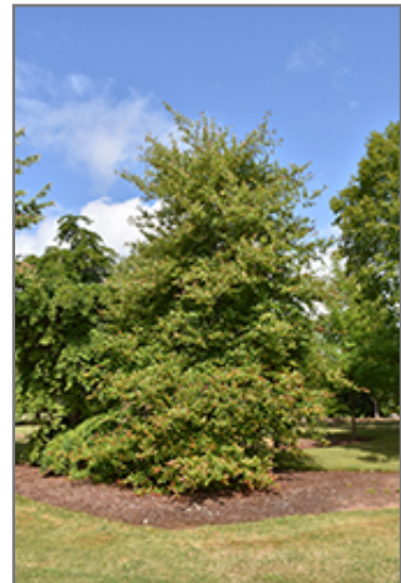
Wildfire Black Gum