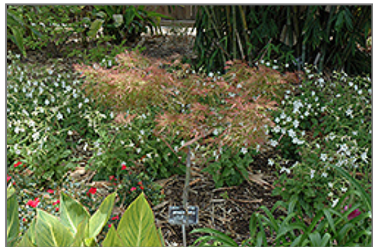
Chantilly Lace Japanese Maple