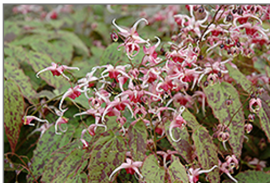
Pink Champagne Fairy Wings flowers