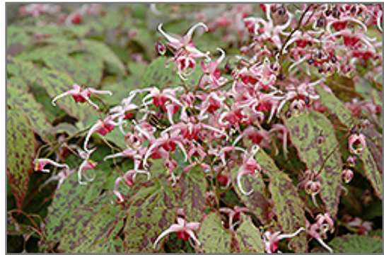
Pink Champagne Fairy Wings flowers