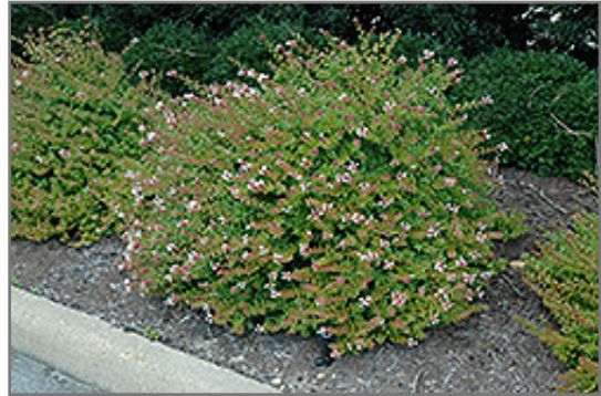
Rose Creek Abelia in bloom

Rose Creek Abelia is recommended for the following landscape applications;