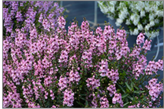
Serenita Pink Angelonia in bloom