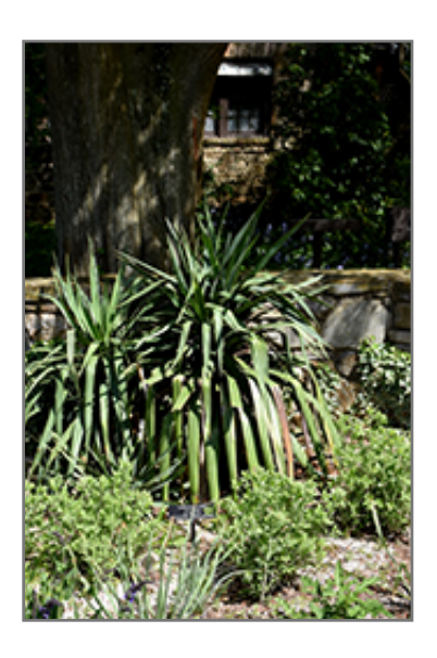
Weeping Yucca