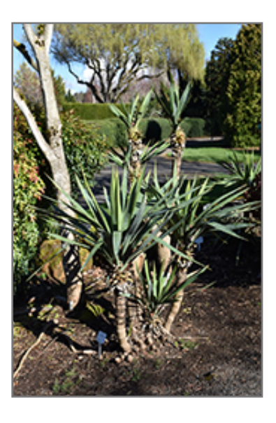
Weeping Yucca

Weeping Yucca is recommended for the following landscape applications;