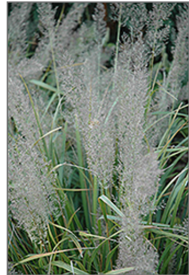
Korean Reed Grass fruit