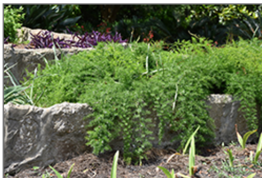
Sprengeri Asparagus Fern

This is a dense herbaceous houseplant with an upright spreading habit of growth. Its extremely fine and delicate texture is quite ornamental and should be used to full effect. This plant may benefit from an occasional pruning to look its best.