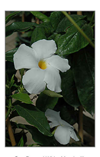
Sun Parasol White Mandevilla flowers

When grown indoors, Sun Parasol White Mandevilla can be expected to grow to be about 10 feet tall at maturity, with a spread of 24 inches. It grows at a medium rate, and under ideal conditions can be expected to live for approximately 20 years. This houseplant will do well in a location that gets either direct or indirect sunlight, although it will usually require a more brightly-lit environment than what artificial indoor lighting alone can provide. It requires an evenly moist well-drained soil for optimal growth. The surface of the soil shouldn't be allowed to dry out completely, and so you should expect to water this plant once and possibly even twice each week. Be aware that your particular watering schedule may vary depending on its location in the room, the pot size, plant size and other conditions; if in doubt, ask one of our experts in the store for advice. It is not particular as to soil type or pH; an average potting soil should work just fine. Be warned that parts of this plant are known to be toxic to humans and animals, so special care should be exercised if growing it around children and pets.