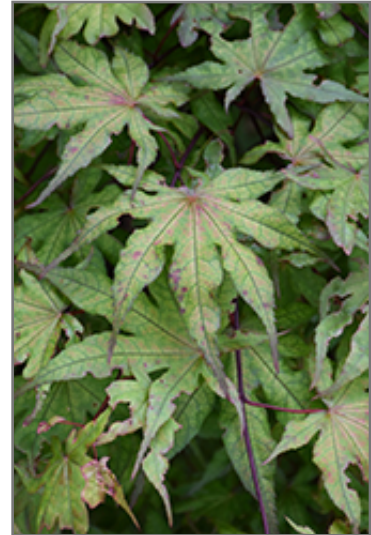
Amber Ghost Japanese Maple foliage