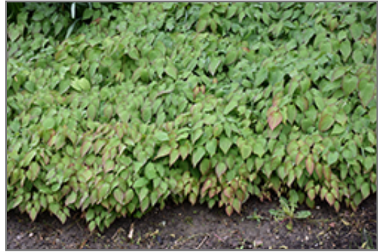
Bishop's Hat