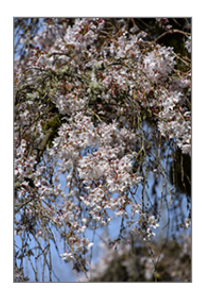
Pink Weeping Cherry flowers