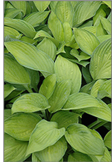
Gold Standard Hosta foliage

Gold Standard Hosta is recommended for the following landscape applications;