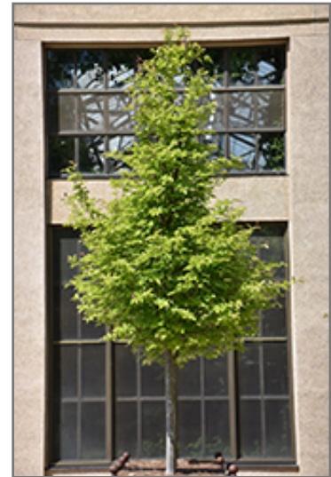
Persian Parrotia