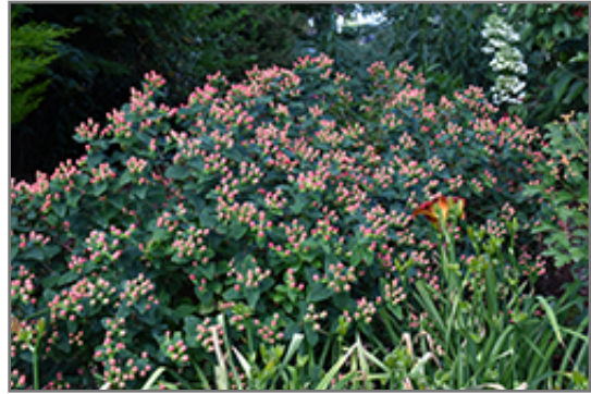
FloralBerry Rosé St. John's Wort fruit

FloralBerry Rosé St. John's Wort will grow to be about 3 feet tall at maturity, with a spread of 3 feet. It tends to fill out right to the ground and therefore doesn't necessarily require facer plants in front. It grows at a medium rate, and under ideal conditions can be expected to live for approximately 5 years. This is a self-pollinating variety, so it doesn't require a second plant nearby to set fruit.