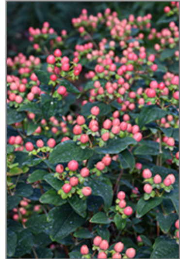
FloralBerry Rosé St. John's Wort fruit

FloralBerry Rosé St. John's Wort is recommended for the following landscape applications;