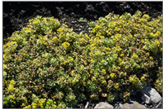
Rock 'N Low Boogie Woogie Stonecrop in bloom