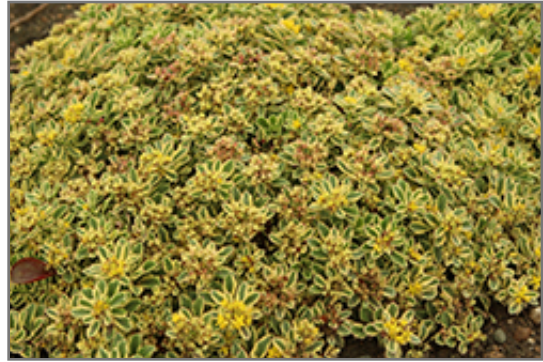
Rock 'N Low Boogie Woogie Stonecrop flowers

Rock 'N Low Boogie Woogie Stonecrop is a dense herbaceous perennial with a mounded form. Its medium texture blends into the garden, but can always be balanced by a couple of finer or coarser plants for an effective composition.