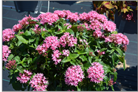
Lucky Star Deep Pink Star Flower in bloom

Lucky Star Deep Pink Star Flower will grow to be about 12 inches tall at maturity, with a spread of 14 inches. When grown in masses or used as a bedding plant, individual plants should be spaced approximately 10 inches apart. Its foliage tends to remain dense right to the ground, not requiring facer plants in front. This fast-growing annual will normally live for one full growing season, needing replacement the following year.