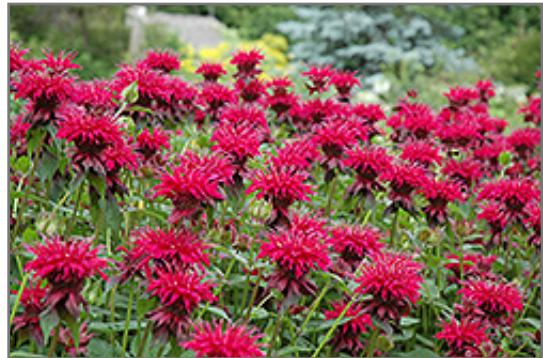
Raspberry Wine Beebalm flowers

Raspberry Wine Beebalm is recommended for the following landscape applications;