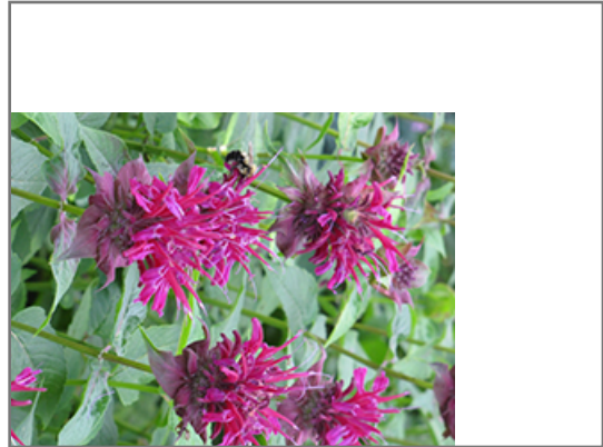
Raspberry Wine Beebalm flowers

Raspberry Wine Beebalm will grow to be about 30 inches tall at maturity, with a spread of 32 inches. When grown in masses or used as a bedding plant, individual plants should be spaced approximately 28 inches apart. It grows at a fast rate, and under ideal conditions can be expected to live for approximately 5 years. As an herbaceous perennial, this plant will usually die back to the crown each winter, and will regrow from the base each spring. Be careful not to disturb the crown in late winter when it may not be readily seen!