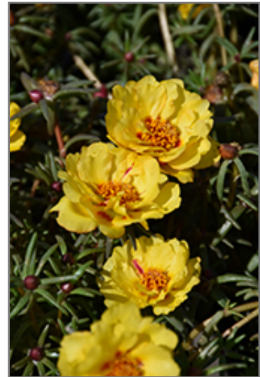
Happy Hour Banana Portulaca flowers

Happy Hour Banana Portulaca is recommended for the following landscape applications;