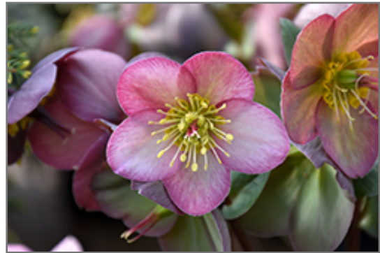
FrostKiss Cheryl's Shine Hellebore flowers

This is a relatively low maintenance plant, and should be cut back in late fall in preparation for winter. Deer don't particularly care for this plant and will usually leave it alone in favor of tastier treats. It has no significant negative characteristics.