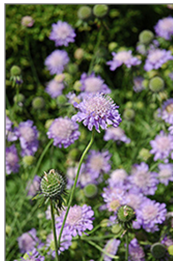
Blue Mist Pincushion Flower flowers