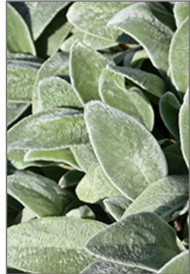
Lamb's Ears foliage

Lamb's Ears is recommended for the following landscape applications;