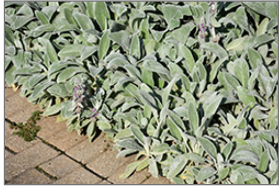
Lamb's Ears

Lamb's Ears will grow to be about 12 inches tall at maturity extending to 24 inches tall with the flowers, with a spread of 18 inches. When grown in masses or used as a bedding plant, individual plants should be spaced approximately 15 inches apart. Its foliage tends to remain dense right to the ground, not requiring facer plants in front. It grows at a fast rate, and under ideal conditions can be expected to live for approximately 10 years. As an herbaceous perennial, this plant will usually die back to the crown each winter, and will regrow from the base each spring. Be careful not to disturb the crown in late winter when it may not be readily seen!