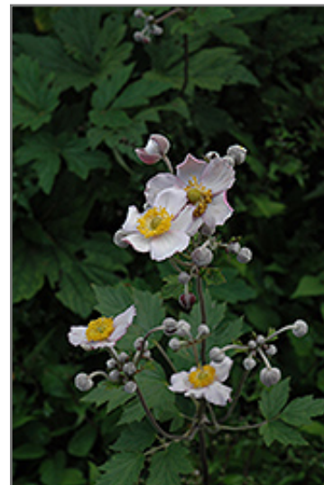
Grapeleaf Anemone flowers

Grapeleaf Anemone is recommended for the following landscape applications;