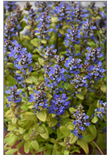
Feathered Friends Fancy Finch Bugleweed flowers