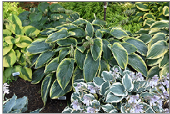
Shadowland Wu-La-La Hosta

This is a relatively low maintenance plant, and is best cleaned up in early spring before it resumes active growth for the season. Gardeners should be aware of the following characteristic(s) that may warrant special consideration;