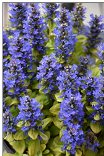
Feathered Friends Petite Parakeet Bugleweed flowers