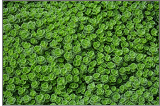
John Creech Stonecrop foliage

John Creech Stonecrop will grow to be only 3 inches tall at maturity, with a spread of 12 inches. When grown in masses or used as a bedding plant, individual plants should be spaced approximately 10 inches apart. Its foliage tends to remain low and dense right to the ground. It grows at a fast rate, and under ideal conditions can be expected to live for approximately 10 years. As an herbaceous perennial, this plant will usually die back to the crown each winter, and will regrow from the base each spring. Be careful not to disturb the crown in late winter when it may not be readily seen!