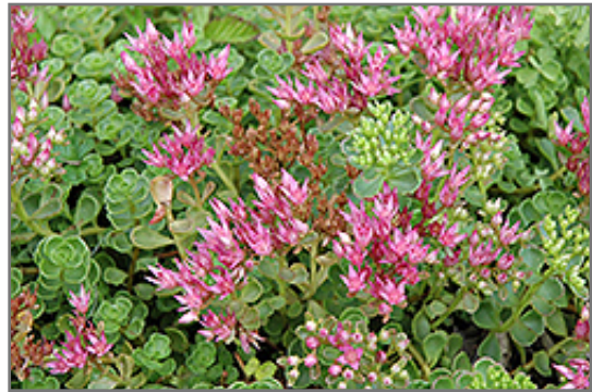
John Creech Stonecrop flowers

John Creech Stonecrop is recommended for the following landscape applications;