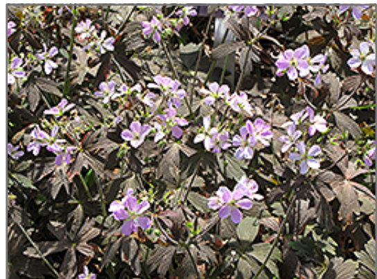
Espresso Cranesbill flowers