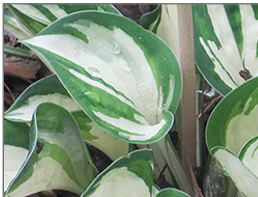
Pandora's Box Hosta foliage

Pandora's Box Hosta is recommended for the following landscape applications;