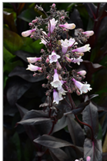
Dark Towers Beard Tongue flowers