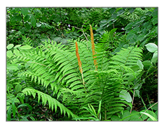
Cinnamon Fern in bloom