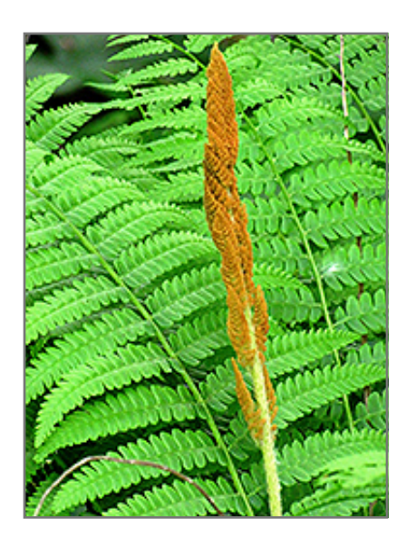
Cinnamon Fern flowers

Cinnamon Fern is recommended for the following landscape applications;