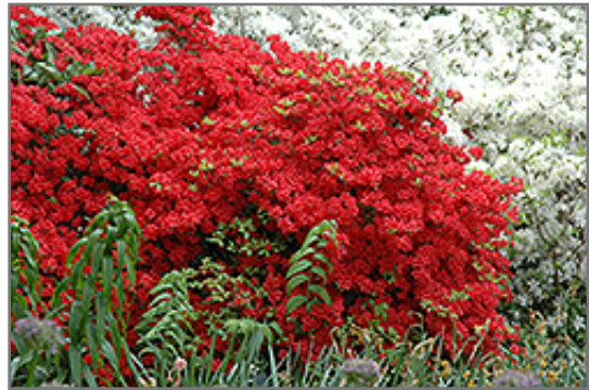
Stewartstonian Azalea in bloom