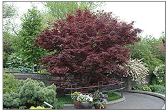
Bloodgood Japanese Maple