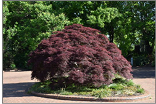
Red-Leaf Threadleaf Japanese Maple

Red-Leaf Threadleaf Japanese Maple is recommended for the following landscape applications;