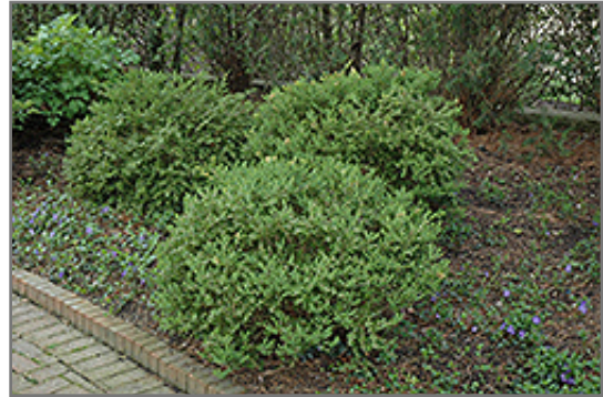
Wintergreen Boxwood