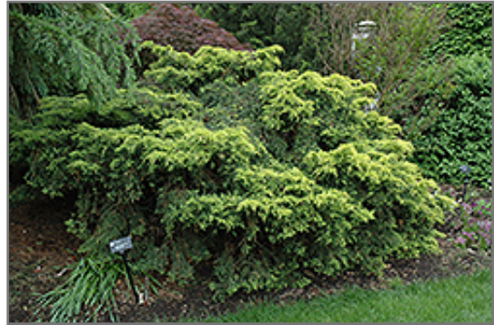
Saybrook Gold Juniper