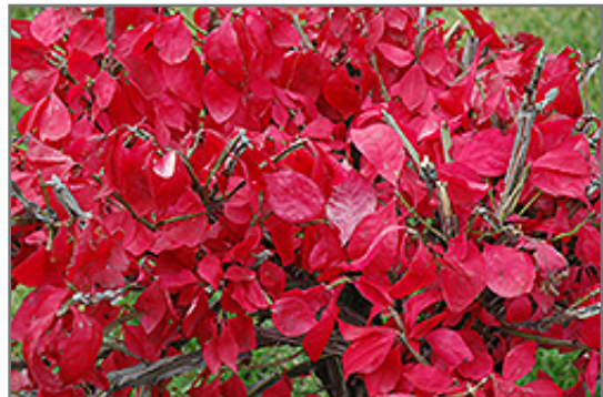
Dwarf-Winged Burning Bush in fall