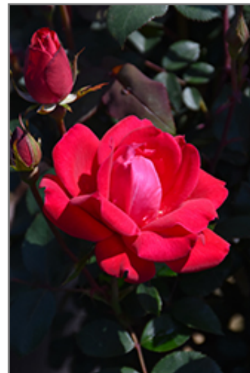
Double Knock Out Rose flowers

Double Knock Out Rose is recommended for the following landscape applications;