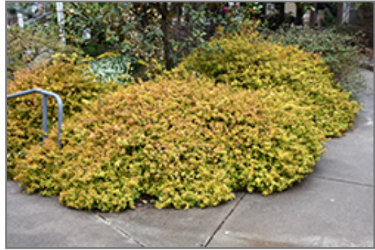
Kaleidoscope Abelia

Kaleidoscope Abelia will grow to be about 30 inches tall at maturity, with a spread of 4 feet. It tends to fill out right to the ground and therefore doesn't necessarily require facer plants in front. It grows at a slow rate, and under ideal conditions can be expected to live for approximately 30 years.