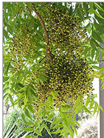
Chinese Pistache fruit

This tree should only be grown in full sunlight. It is very adaptable to both dry and moist growing conditions, but will not tolerate any standing water. It is not particular as to soil type or pH. It is highly tolerant of urban pollution and will even thrive in inner city environments. This species is not originally from North America.