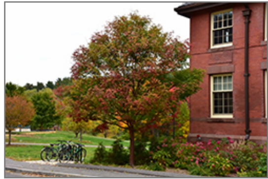
Gingerbread Paperbark Maple in fall