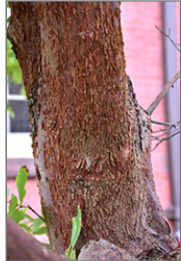
Gingerbread Paperbark Maple bark

This tree does best in full sun to partial shade. It prefers to grow in average to moist conditions, and shouldn't be allowed to dry out. It is not particular as to soil type or pH. It is somewhat tolerant of urban pollution. This particular variety is an interspecific hybrid.