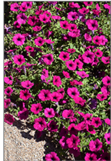
Wave Purple Classic Petunia flowers